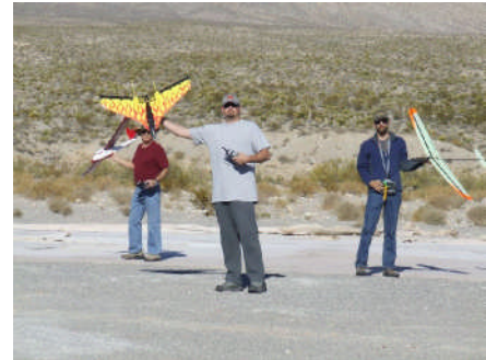
3 guys with 3 planes